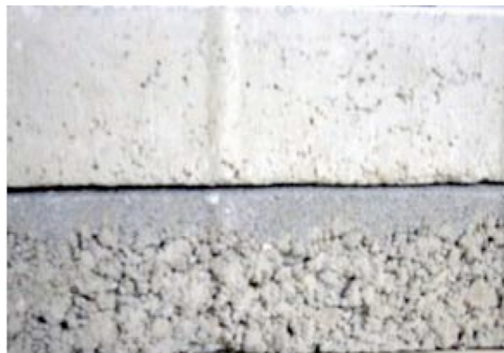
With and without M-Cast 64

A dosage of 0.3%, 5 fluid oz per 100 lb cement weight is recommended. Under such conditions, the water content in the initial concrete formulation is increased by 15%. The M-CAST 64 is conventionally introduced in the concrete mixer with the dry raw materials. The high alkalinity of the concrete activates the thixotropic behavior of M-CAST 64.