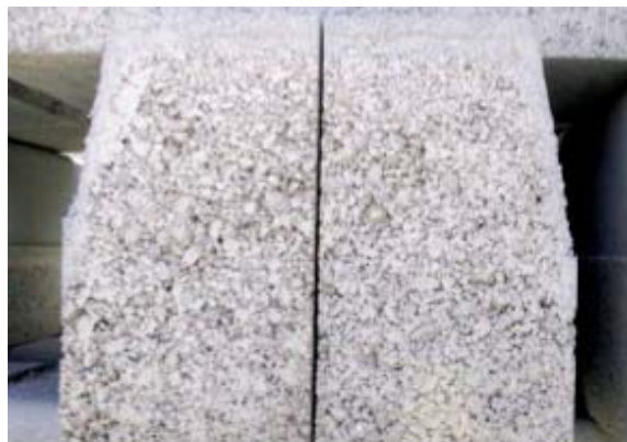
Without M-Cast 64