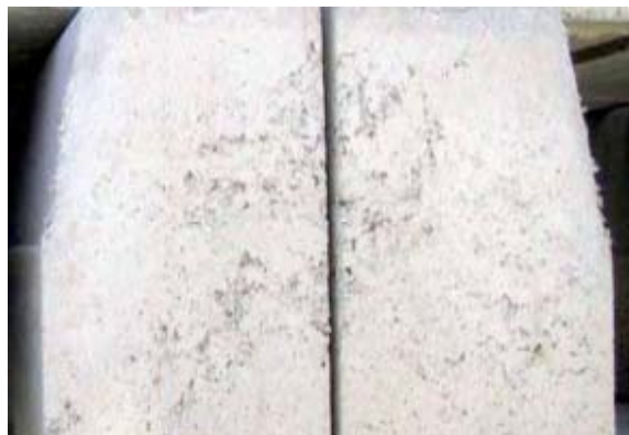
With M-Cast 64